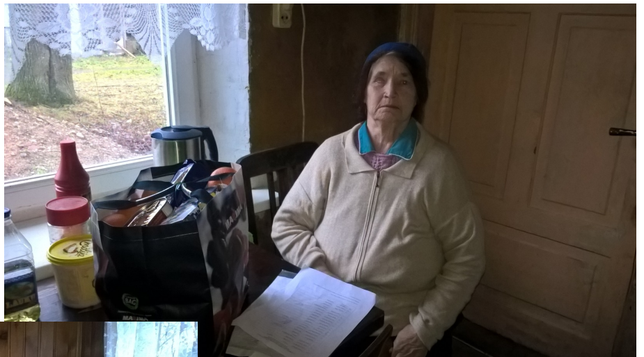
Pensionāres no Zemītes