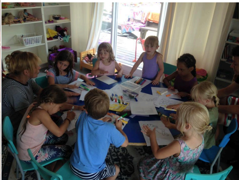
‘Cālīši’ aizraujas ar krāsošanu/ Intensive colouring!