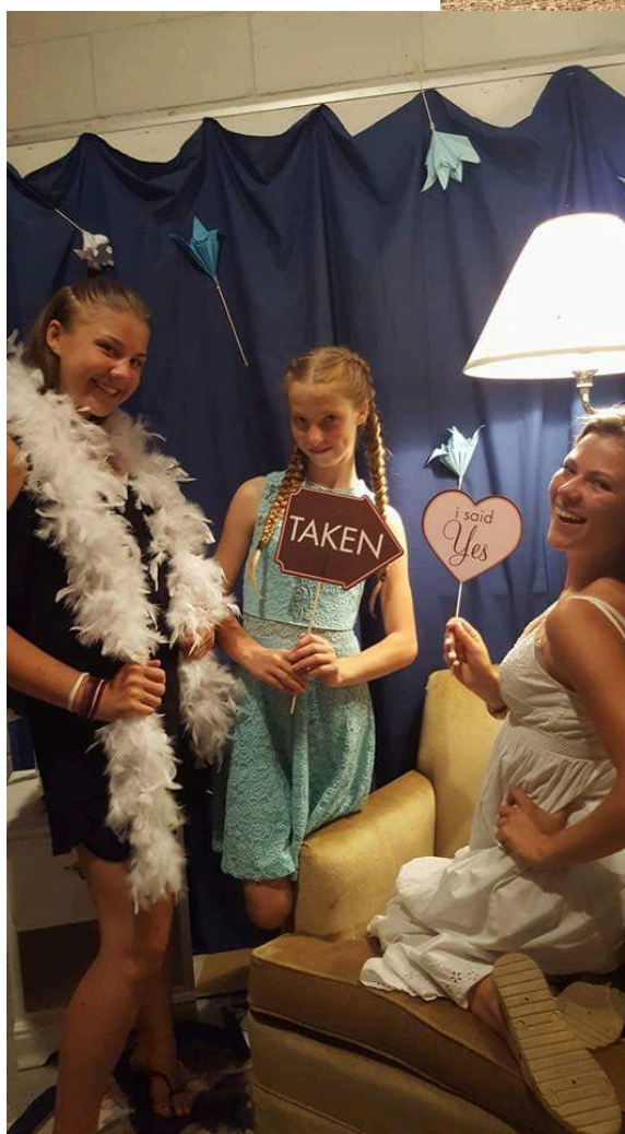
Meitenes pošas uz ballīti/ Primping for the dance!